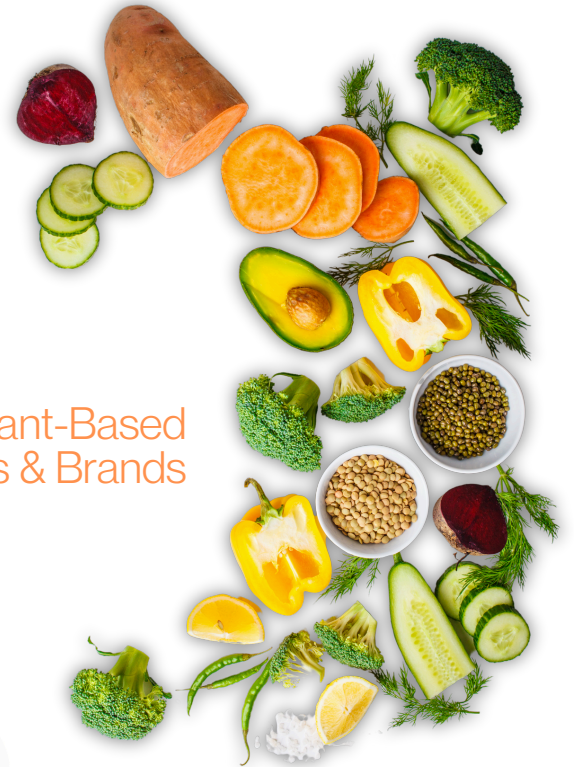
Vegan & Plant-Based Products & Brands