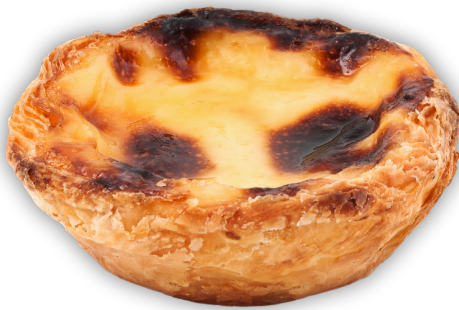
Speciality & Country Specific Products & Brands