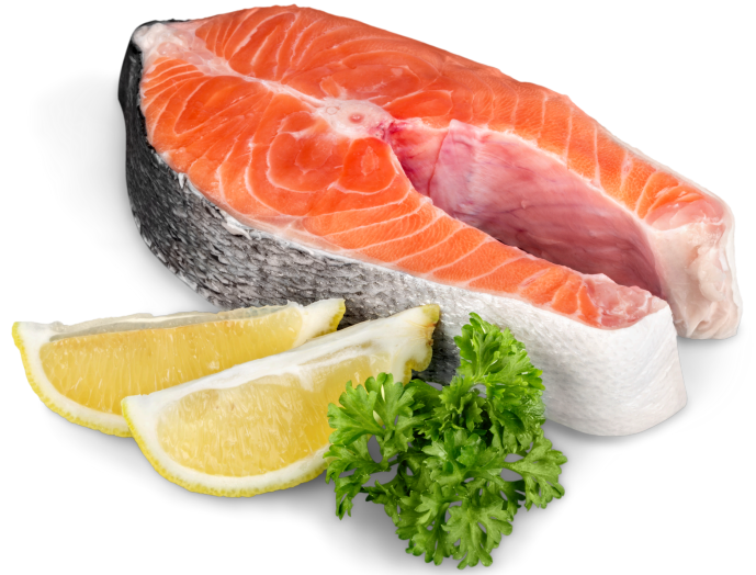
Seafood Products & Brands