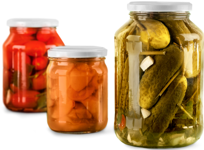
Newly Introduced Products & Brands