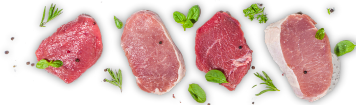
Beef, Lamb & Pork